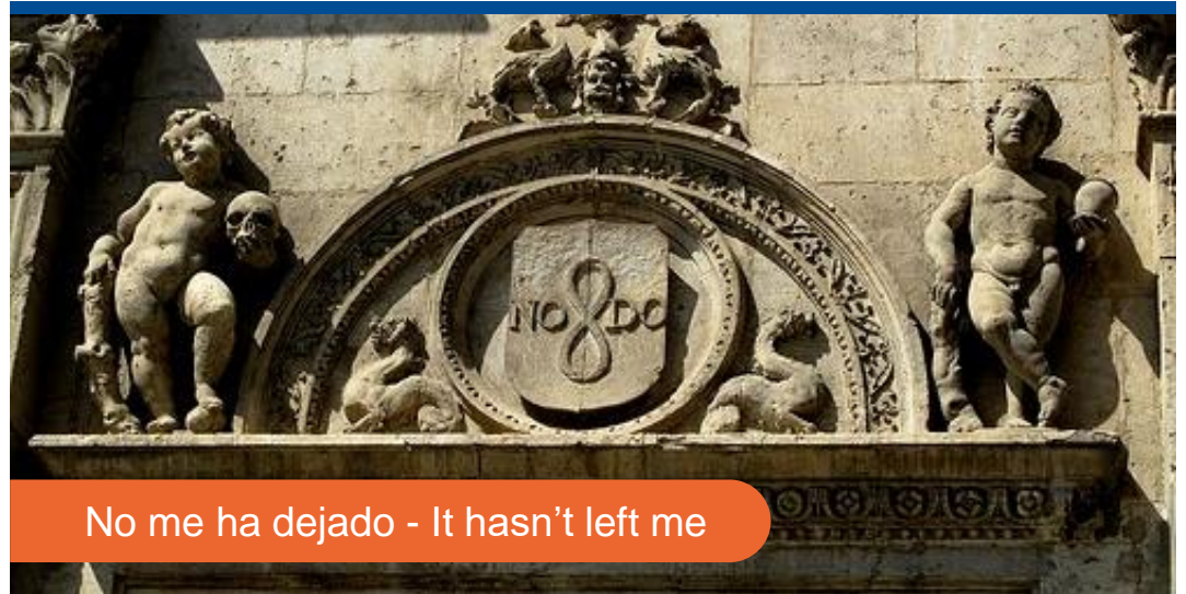
No me ha dejado - It hasn't left me