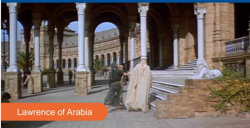
Lawrence of Arabia