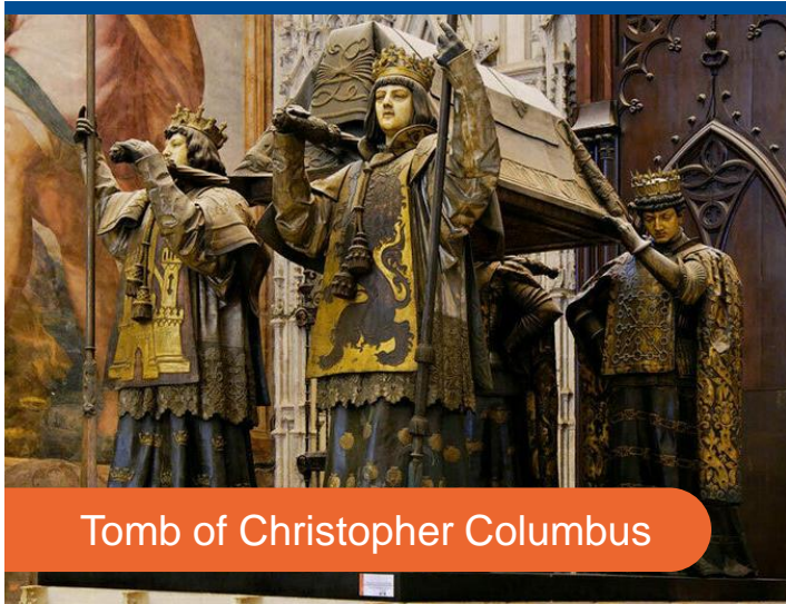
Tomb of Christopher Columbus