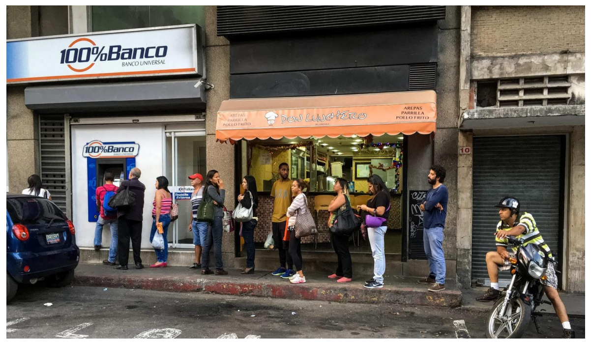
People wait to withdraw money from an ATM in Caracas, Venezuela, Dec 19 2016.

On Thursday, for the third straight day, a construction worker spent his lunch hour in east Caracas in line at an ATM. The problem was that the bank would allow him to take out only the equivalent of $4 a day.